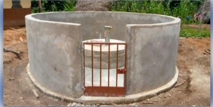
Figure 2 fencing and protection of hand dug well