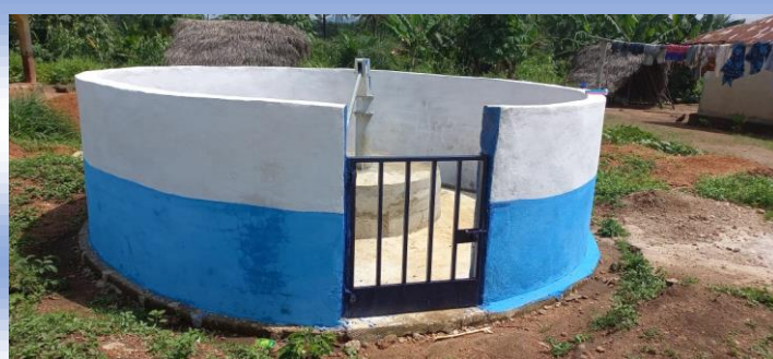
Figure 14 painting of constructed hand dug well