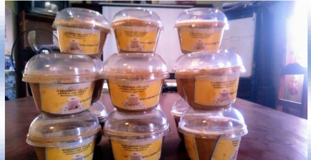
Value Addition on groundnut