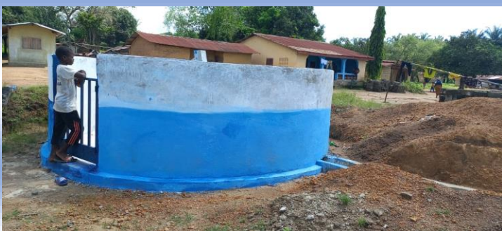
Figure 13 painting of constructed hand dug well