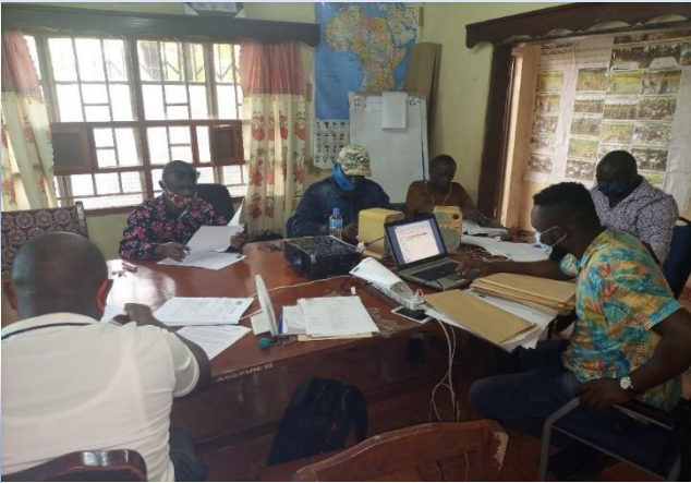
Figure 16 proposal Review sub grant loan