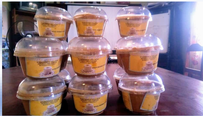
Value Addition on groundnut