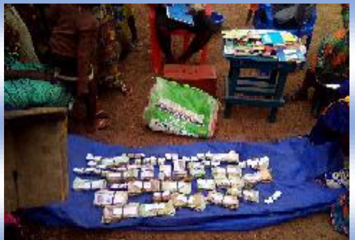
Figure 12 VSLA share- out