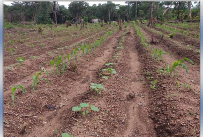
Figure 10 maize and okra demonstration plot