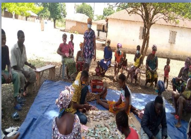
Figure 11 Village Saving and Loan share-out