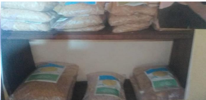
Value Addition on Rice