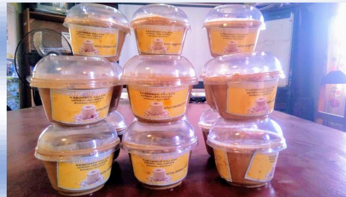
Value Addition on groundnut