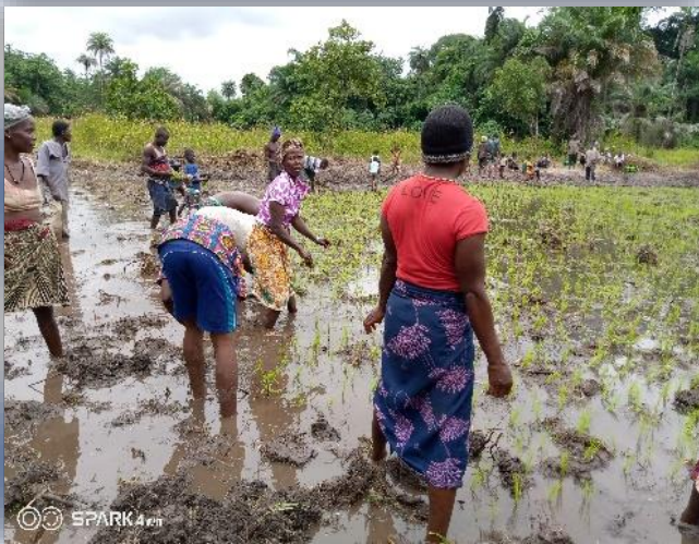
Figure 5 Rice cultivation on in-valley swamp