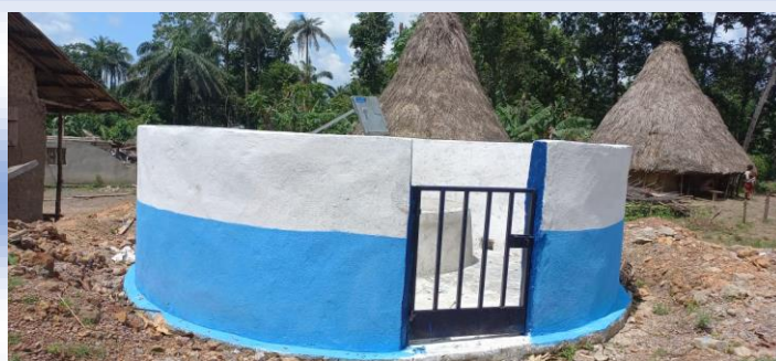
Figure 12 painting of constructed hand dug well