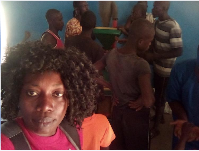
Pre- test on constructed rice milling and distoner machine