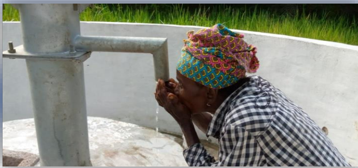
Figure 5 old women having access to safe drinking water