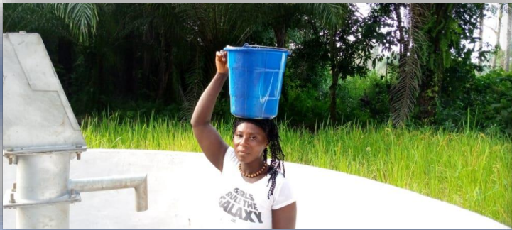
Figure 9 community people accessing newly constructed hand dug well for clean and safe drinking water