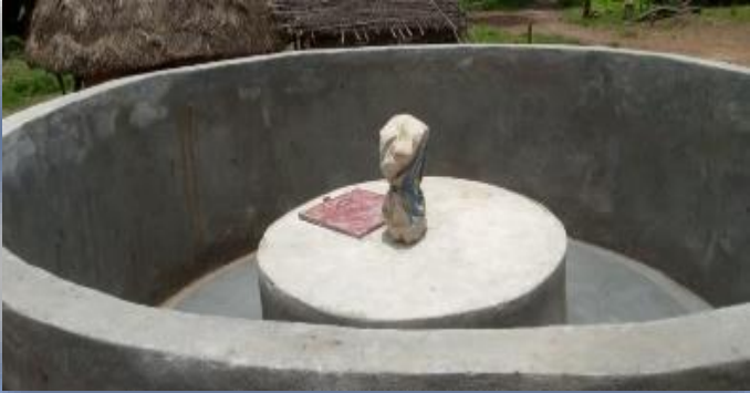
Figure 1 construction of hand dug well