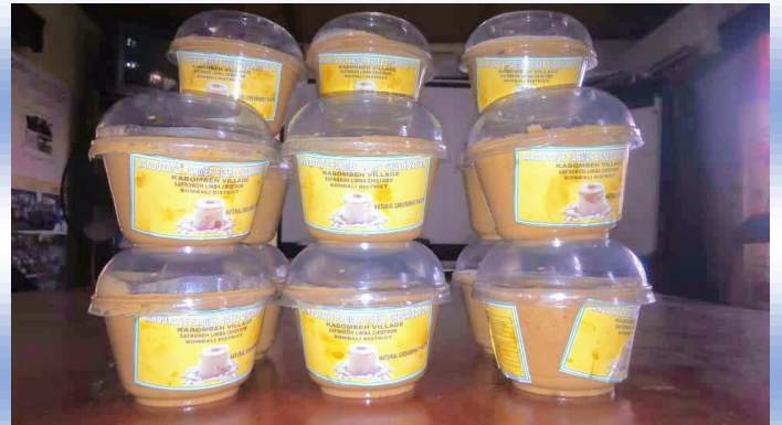
Value Addition on groundnut