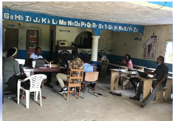
Figure 19 Minimum Requirement Assessment with one of the CBO