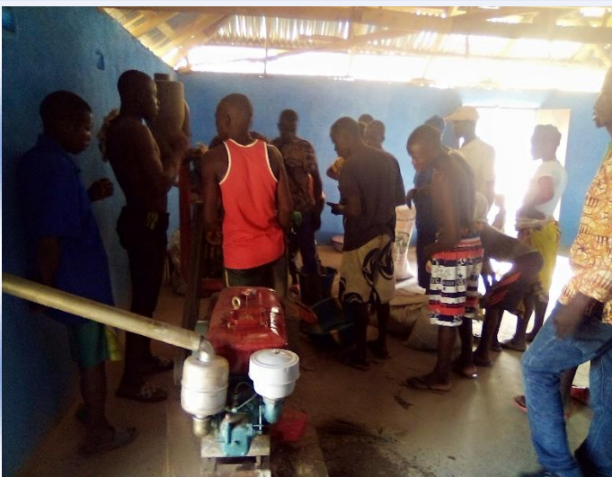
installation of rice mill and distoner machine