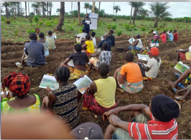
Figure 9 practical training on agro ecology