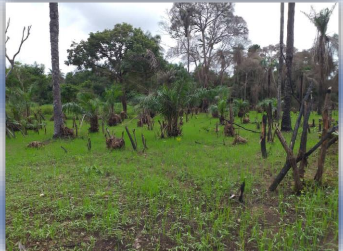
Figure 6 upland cultivation of rice