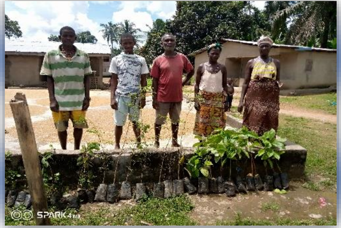
Figure 2 distribution of assorted trees to project beneficiaries