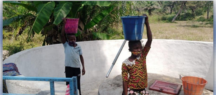
Figure 4 children having access to safe cleaning water