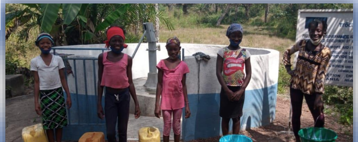
Figure 8 AAD-SL granting the community access to newly constructed hand dug well.

AAD-SL is strongly committed to the protection and safety of its project participants including children and women and therefore does not accept any form of abuse and exploitation