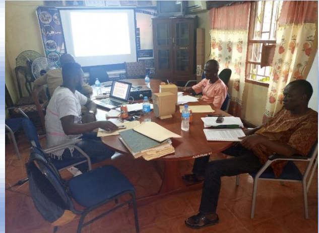
Figure 17 proposal Evaluation on sub grant loan