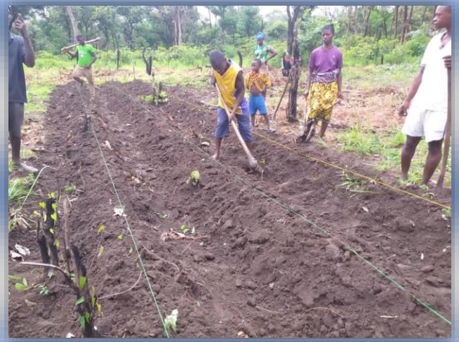
Figure 4 construction of Seedbed