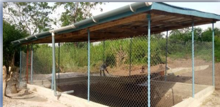
Figure 16 construction of water trench