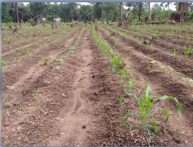
Figure 3 maize and okra vegetable production