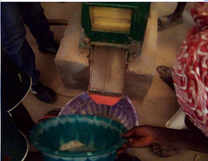
Pre-test on Rice milling and distoner machine