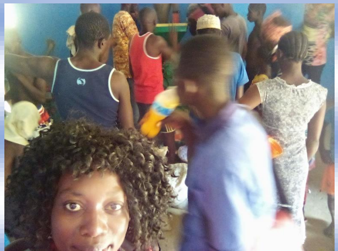
pre testing on constructed rice milling machine