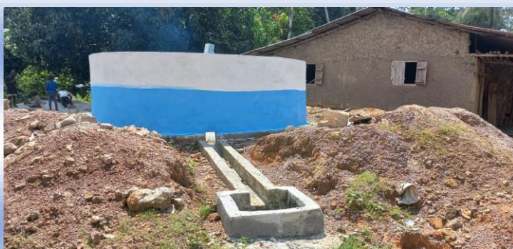
Figure 15 construction of drainage from hand dug well