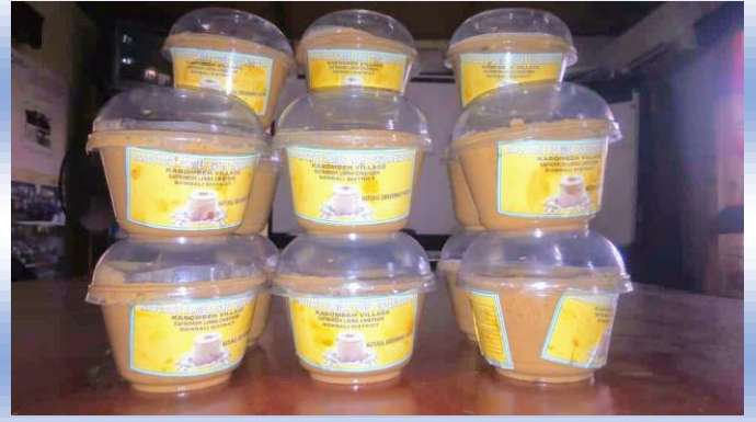
Value Addition on groundnut