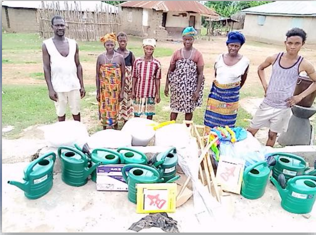
Figure 1 distribution of farm tools to project beneficiaries