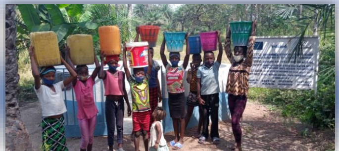
Figure 6 children enjoying access to safe drinking water