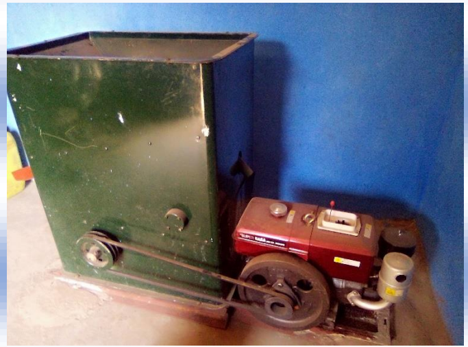
Rice milling machine