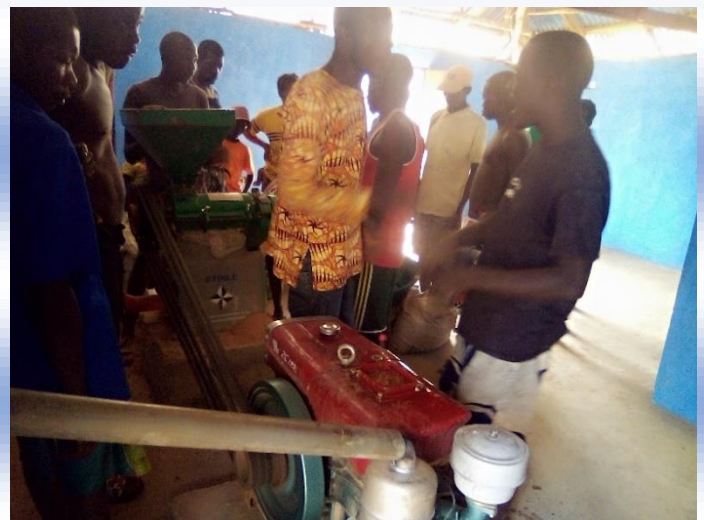
complete installed rice mill and distoner machine