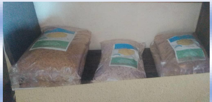
Value Addition on Rice