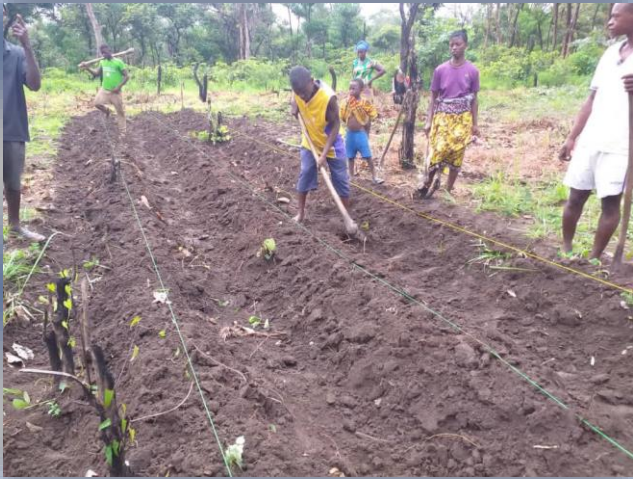
Figure 7 ridges construction