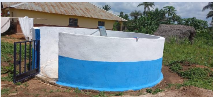
Figure 11 painting of constructed hand dug well