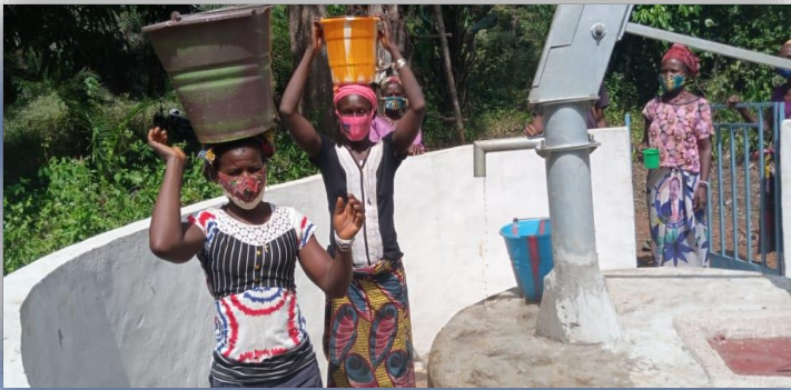
Figure 3 women having access to safe cleaning water