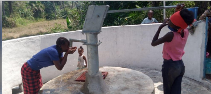
Figure 10 pretest after installation of newly constructed hand dug well