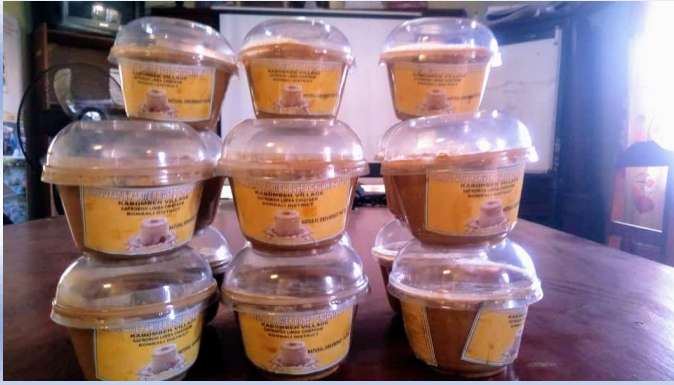
Value Addition on groundnut