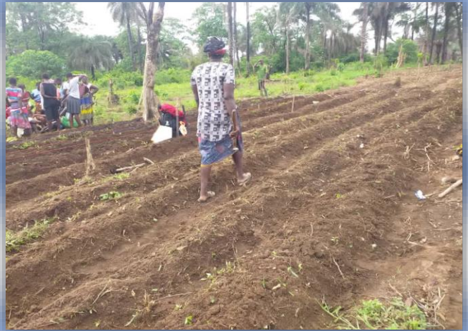
Figure 8 cultivation of maize and okra